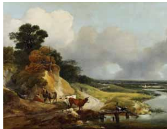
Thomas Gainsborough, Landscape with a View of a Distant Village , c.1750

Organised by the Holburne Museum. Curated by Dr. Susan Sloman.