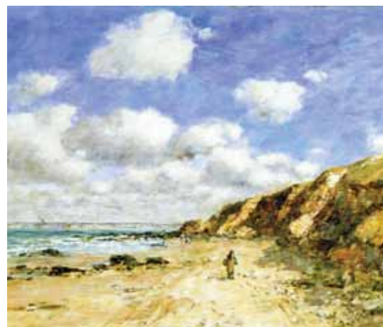
Eugène Boudin (1824-1898), A Beach near Trouville

Relating to our exhibition Into the light: French and British painting from Impressionism to the early 1920s . Students will explore the production of paintings on both sides of the Channel from the 1870's to the 1920's. They will compare artists' work and discover how a more spontaneous approach to painting produced new ways of depicting light changes in the landscape. After a tour of the exhibition students will create their own colour landscape by sketching outside in the Compton Verney grounds.