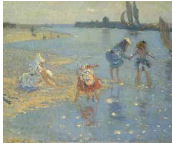
Phillip Wilson Steer (1860-1942), Walberswick, Children Paddling. In the collection of the Fitzwilliam Museum, Cambridge