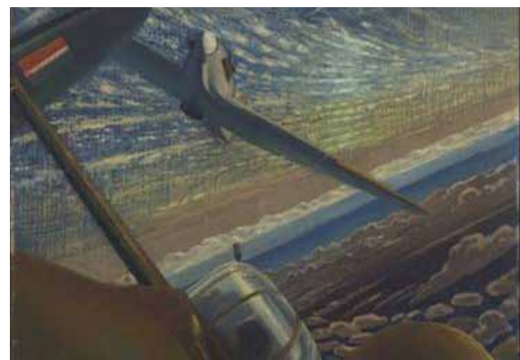
Walter Monnington, Fighter Affiliation: Halifax and Hurricane aircraft co-operating in action, 1943 , Imperial War Museum