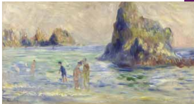
Pierre Auguste Renoir (1841-1919) Moulin Huet Bay, Guernsey