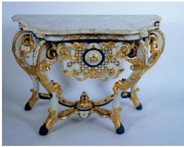
Table : Attributed to Daniel Marot (1661–1752)